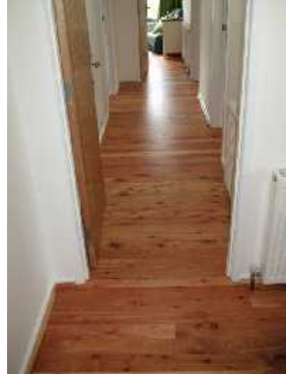
Doorway to bedroom corridor