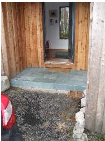
Approach to front door porch