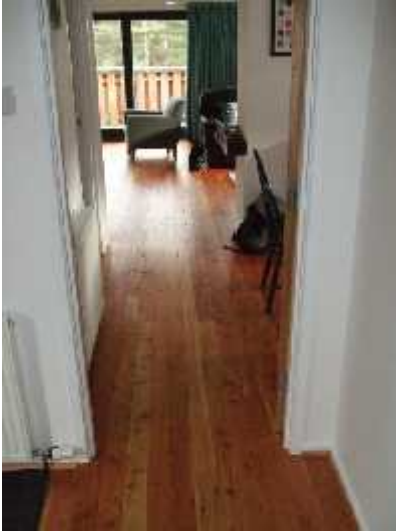
Doorway from hall to living area